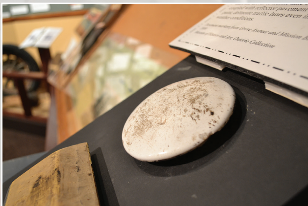
Bott's Dot. Photo courtesy of the Ontario Museum of History & Art.

Take your own ride and check out the historic displays at the museum. To learn more about Bott's Dot and the Riverside Wheelmen, visit the Roadways exhibit at the Ontario Museum of History & Art.