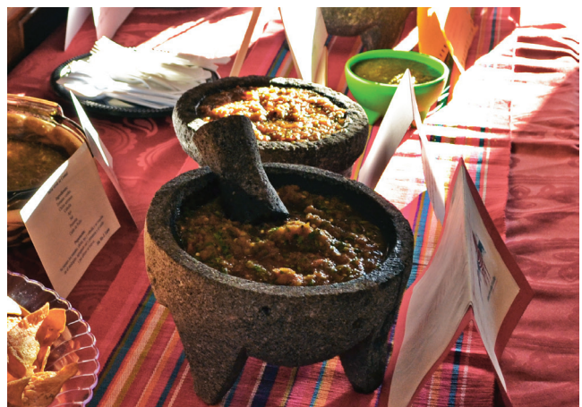
Huerta del Valle Community Garden participants and museum visitors at the Salsa at the Museum program.