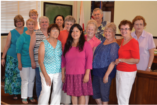
2015 Museum Associates