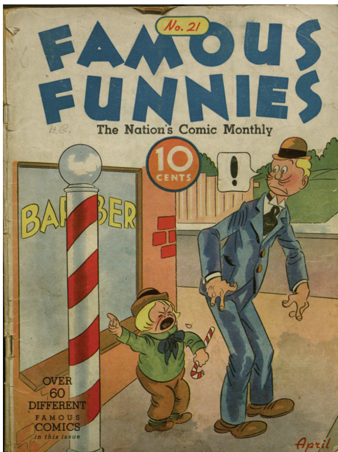
Famous Funnies , c. 1936; 10 1/2 x 6 1/2 inches, ink on paper; Courtesy of University of Missouri Libraries, Special Collections.

of word- and image-making, to consider the roles of image and narrative in our cultures, and to examine storytelling techniques in different media.