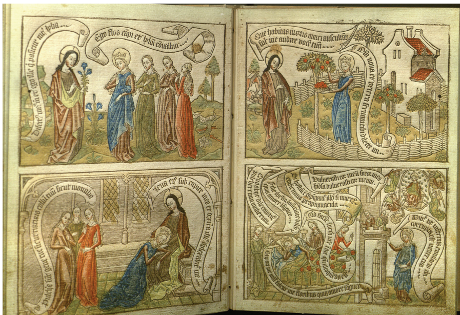
Canticum Canticorum, c. 1922 reproduction of 15th century original; 11 x 16 inches, ink on paper

The Museum's next exhibit, Beyond Words: Visual Narratives from the Block Book to the Graphic Novel , begins toward the end of the Middle Ages, when early book printers in the West used carved wooden blocks to stamp words and images onto the page. Because of their method of production, these books later came to be known as "block books." Rather than presenting an evolutionary history of visual storytelling, the works selected for this traveling exhibition allow us to situate woodcuts, engravings, comic strips, and graphic novels in a long tradition