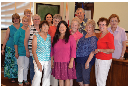
2015 Museum Associates