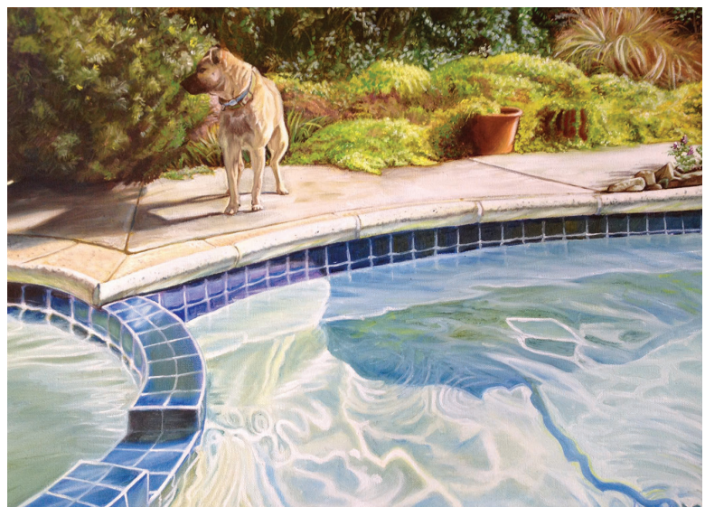
Yellow Dog by Blue Pool , 2015.