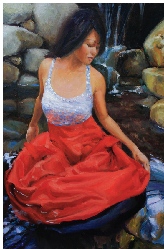
Top left: Through the Looking Glass , 2015.